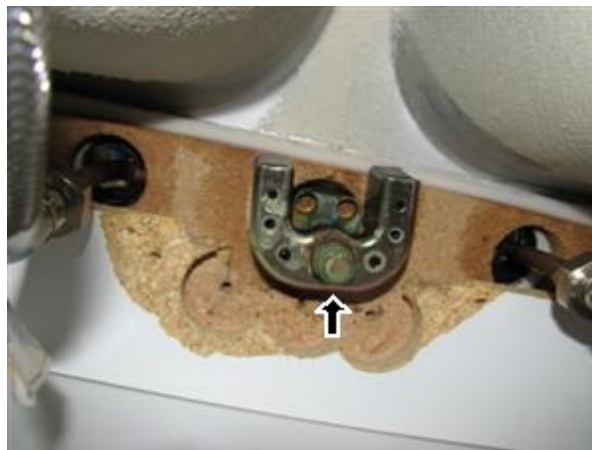
5.0 Picture 2

5.1 The kitchen cabinetry was in satisfactory condition, relative to the age of the home.