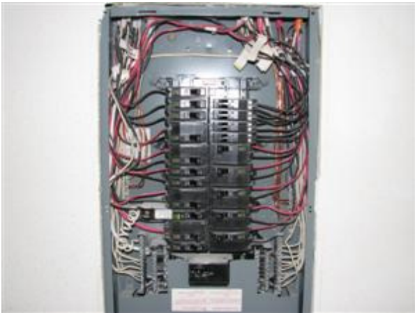
8.2 Picture 1