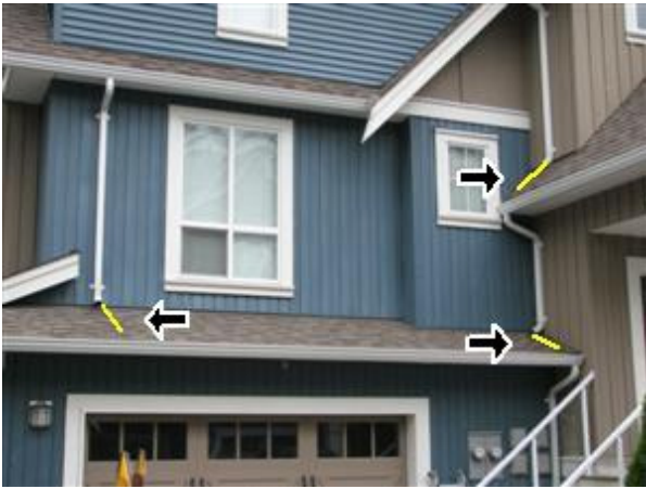
3.4 Picture 3