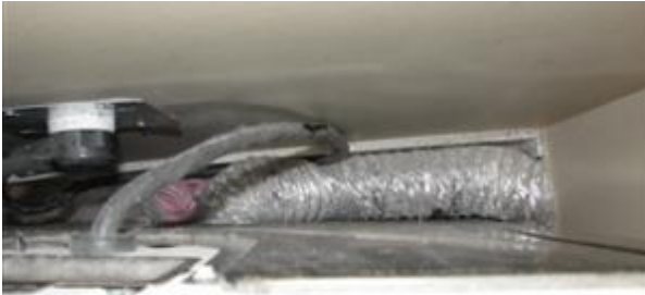
7.5 Picture 1

7.5 The dryer is vented with flexible metal ducting, which is excellent to see. I recommend periodically cleaning the duct and vacuuming any lint out from behind the dryer.