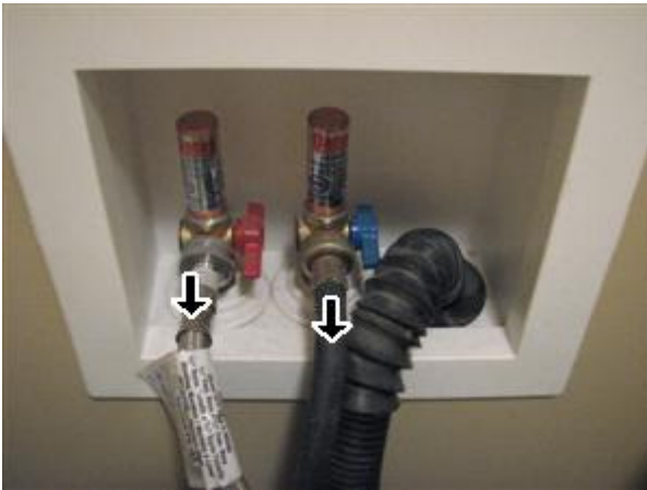
7.9 Picture 1

NOTE: The interior of the home was inspected and reported on with the above information. While the inspector makes every effort to find all areas of concern, some areas can go unnoticed. The inspection did not involve moving furniture and inspecting behind furniture, area rugs or areas obstructed from view. Please be aware that the inspector has your best interest in mind. All repair needs or recommendations for further evaluation should be addressed prior to closing. It is the client's responsibility to perform a final inspection to determine house and element conditions at the time of closing. If any decision about the property, or its purchase, would be affected by any condition or the cost of any required or discretionary remedial work, further evaluation and/or contractor cost quotes should be obtained prior to making any such decision.