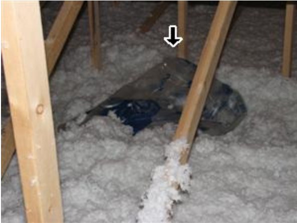
12.5 Picture 1

12.5 As previously mentioned in the Electrician Section, the Electrician needs to return to repair the mess he made of the Vapour Barrier.