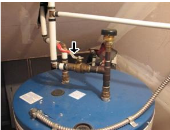
10.1 Picture 1

10.1 HW Tank shut-off located directly above the tank (pictured).