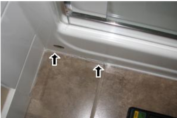
6.7 Picture 1

6.7 Flooring was tile and in satisfactory condition. I recommend periodically checking the silicone caulk along floor and tub as a regular maintenance item, as well as cleaning and sealing the grout between the tiles. No deflection noted, however absolute determination of the substrate not possible.