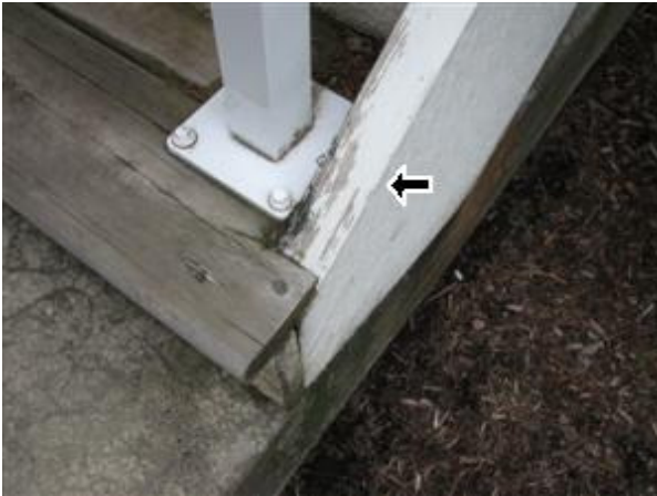
2.5 Picture 1

2.5 The front entry and enclosed decks are in satisfactory condition, relative to the age of the home. I recommend paint where required.