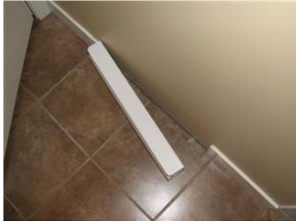
11.0 Picture 4

11.1 Your secondary source of heat is a permanently installed Electric Fireplace in the Living Room. The switch to activate is in the lower right corner.