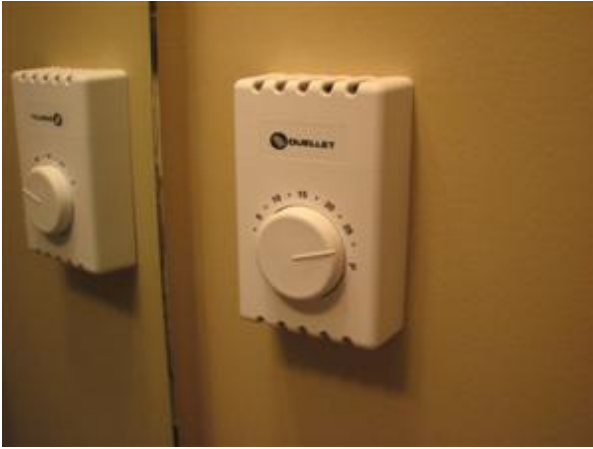
11.0 Picture 3