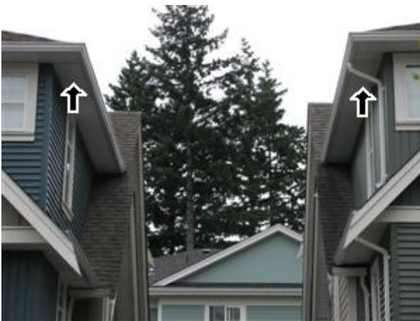
3.4 Picture 2

I recommend having the STRATA bring in the contractor who built the complex and have them finish the work they started.