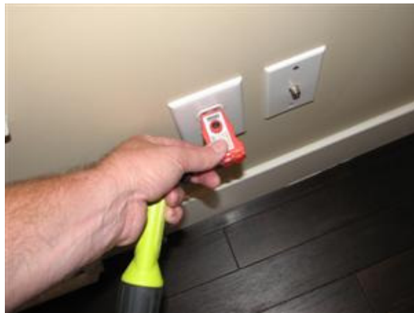
8.4 Picture 2

8.5 For the most part there are no issues noted with visible Lumex wiring. However... up in the attic the Electrician was sloppy. The wiring running to one of the ceiling fixtures is laying coiled loose. It should be taugt and stapled to the truss to prevent someone tripping over it. Additionally, the vapour barrier has been disturbed. I recommend the Electrician return and correct this.