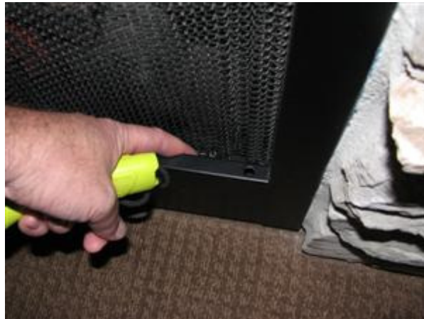
11.1 Picture 2

NOTE: The heating and cooling system of this home was inspected and reported on with the above information. While the inspector makes every effort to find all areas of concern, some areas can go unnoticed. The inspection is not meant to be technically exhaustive. The inspection does not involve removal and inspection behind service door or dismantling that would otherwise reveal something only a licensed heat contractor would discover. Please be aware that the inspector has your best interest in mind. All repair needs or recommendations for further evaluation should be addressed prior to closing. It is the client's responsibility to perform a final inspection to determine house and element conditions at the time of closing. If any decision about the property, or its purchase, would be affected by any condition or the cost of any required or discretionary remedial work, further evaluation and/or contractor cost quotes should be obtained prior to making any such decision.