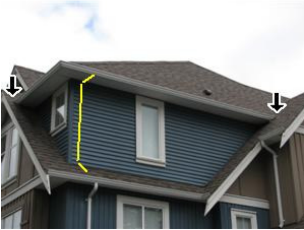
3.4 Picture 1