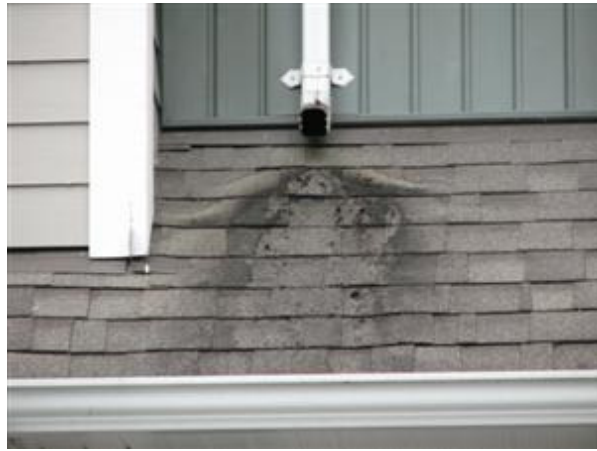
3.4 Picture 4

NOTE: The roof of the home was inspected and reported on with the above information. While the inspector makes every effort to find all areas of concern, some areas can go unnoticed. Roof coverings and skylights can appear to be leak proof during inspection and weather conditions. Our inspection makes an attempt to find a leak but sometimes cannot. Please be aware that the inspector has your best interest in mind. All repair needs or recommendations for further evaluation should be addressed prior to closing. It is the client's responsibility to perform a final inspection to determine house and element conditions at the time of closing. If any decision about the property, or its purchase, would be affected by any condition or the cost of any required or discretionary remedial work, further evaluation and/or contractor cost quotes should be obtained prior to making any such decision.