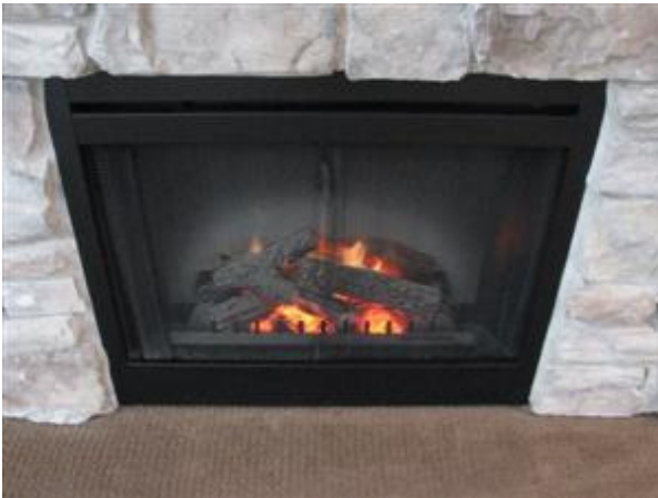
11.1 Picture 1

11.1 Your secondary source of heat is a permanently installed Electric Fireplace in the Living Room. The switch to activate is in the lower right corner.