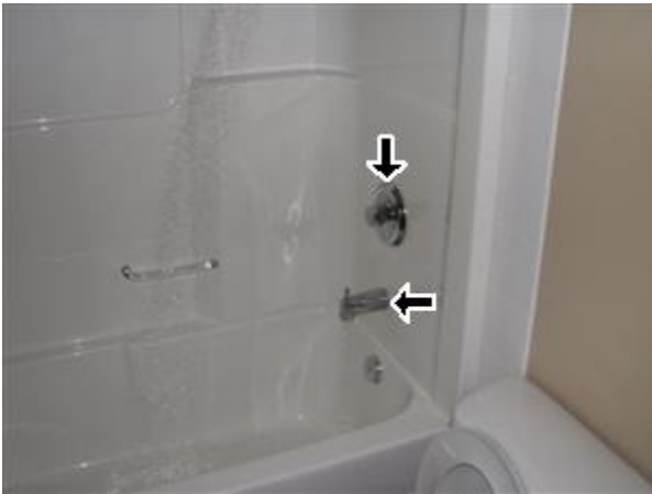
6.3 Picture 1

6.4 No issues noted with the one-piece shower stall. I ran the shower for 4 - 5 minutes and drainage was satisfactory. The FAIR rating is due to the glass door not seating properly. This leads to water splashing out onto the floor, which can cause flooring issues. I recommend this be corrected.