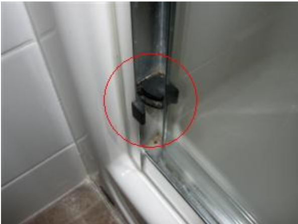
6.4 Picture 1

6.4 No issues noted with the one-piece shower stall. I ran the shower for 4 - 5 minutes and drainage was satisfactory. The FAIR rating is due to the glass door not seating properly. This leads to water splashing out onto the floor, which can cause flooring issues. I recommend this be corrected.