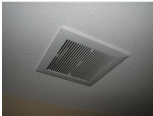
7.7 Picture 2

7.8 The condition of the trim was satisfactory, relative to the age of the home.