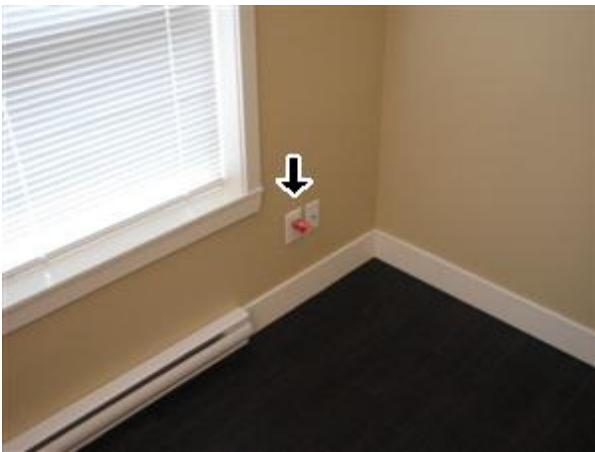
8.4 Picture 1

8.4 Other than one loose receptacle in the Family Room, no electrical issues noted with the receptacles, switches or fixtures at the time of inspection. I recommend the Electrician tighten the check that the connections have not become loose and tighten the receptacle.