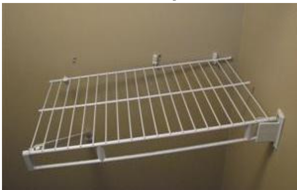
7.1 Picture 1

7.1 The walls were in satisfactory condition, typical for a home of this age. I did not see one wire shelf that has been torn from the wall. I recommend this be repaired.