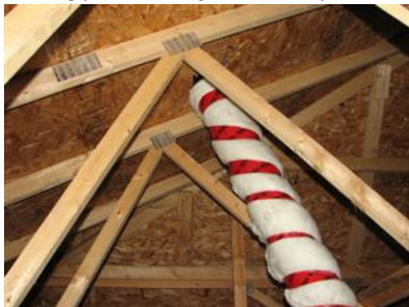
12.1 Picture 1

12.1 The plywood sheathing is in satisfactory condition with no issues noted.