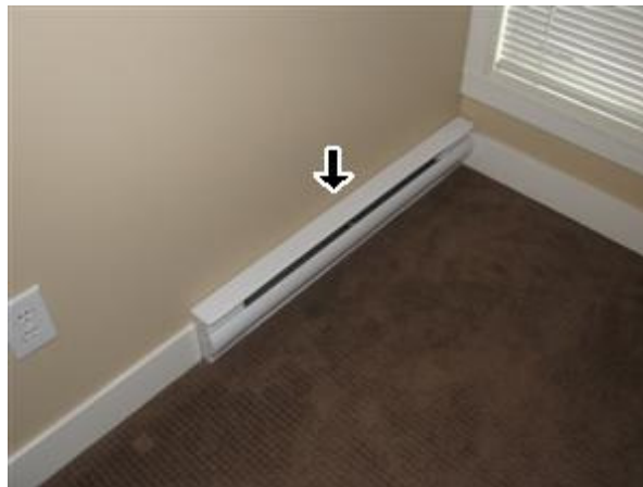
11.0 Picture 2

The Baseboard Heater in the Upstairs Main Bathroom does not function. Like the Bedroom, the Thermostat activates but no heat is generated. Additionally, the Heater was never attached to the wall! I recommend The Electrician return and repair these issues!