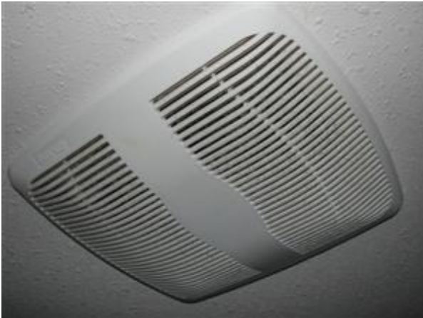
6.11 Picture 1

As showers generate an excessive amount of humidity, which can damage ceilings and create mould & mildew growth, a recommended upgrade would be to have a licenced electrician install a timer switch on the ventilation fan where you will be doing the most showering, to allow 30 minutes of run-on after showering.