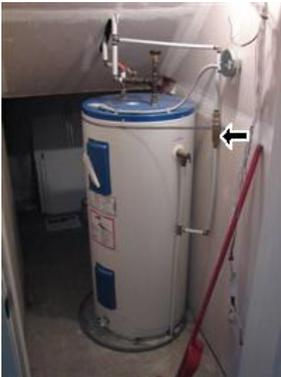
10.4 Picture 1

NOTE: Maintain hot-water supply temperatures at no more than about 120 degrees F (49 degrees Celsius) for personal safety; hot water represents a potential scalding hazard. Anti-scald devices are available as an added safety measure. The combustion chamber or ignition sources of water heaters and other mechanical equipment in garage areas should be positioned/maintained at least 18 inches above the floor for safety reasons. Adequate clearance to combustibles must also be maintained around the unit and any vents. Restraining straps are generally required on heaters in active seismic zones. Safety valve (TPRV) discharge should be through a drain line to a readily visible area that can be monitored. Newer tanks should be drained periodically, but many old tanks are best left alone. Tankless or boiler coils systems have little or no storage capacity; a supplemental storage tank can often be added if needed. A qualified plumber or specialist should perform all water heating system repairs. All repair needs or recommendations for further evaluation should be addressed prior to closing. It is the client's responsibility to perform a final inspection to determine house and element conditions at the time of closing. If any decision about the property, or its purchase, would be affected by any condition or the cost of any required or discretionary remedial work, further evaluation and/or contractor cost quotes should be obtained prior to making any such decision.