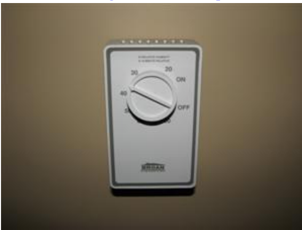
7.7 Picture 1

7.7 While a humidistat was noted as being installed, it was turned OFF. It is important to always have it adjusted properly (approx 35% - 40% relative humidity) so that it does not become too humid in the home, which can lead to mould and mildew growth, which are proven health hazards.