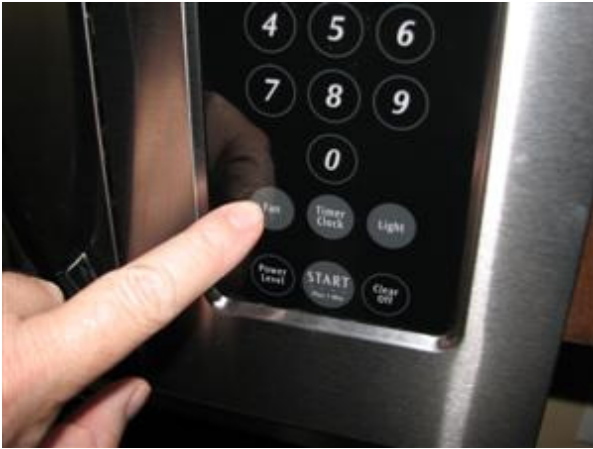
5.6 Picture 1

5.6 The FAN function on the built-in Microwave does not operate. I recommend repair or replacement.