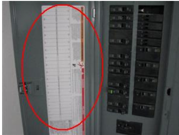
8.2 Picture 2

8.3 The main panel box is located at the garage.