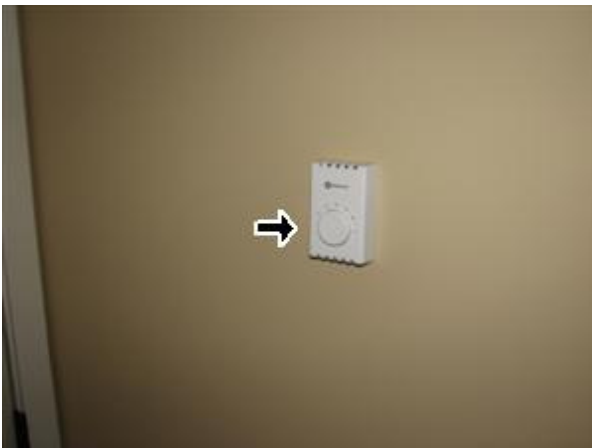
11.0 Picture 1

The Baseboard Heater in the upstairs, NW corner bedroom does not function. The thermostat activates when adjusted, however no heat is generated from the heater.